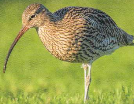
Rare birds like the Dartford warbler and this curlew try to nest in the heathlands – near or on the ground.